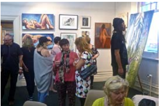
Part of the crowd at The Nude exhibition opening on 21st March.