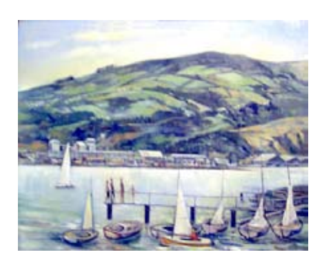
Vauxhall, Otago Harbour, 1952. (This work is in the OAS permanent collection, donated by the artist.)