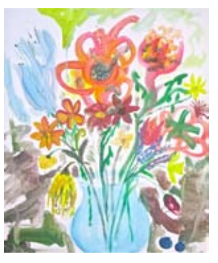
It might not be high art, but it was fun. Pictured is the end result of a collaborative effort by attendees at the Volunteers afternoon tea, with each contributor having a minute to paint a flower to add to the vase.