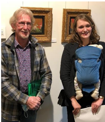
Hughes Family Trust Award: