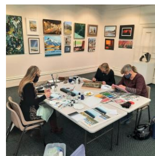
Thursday Painting group

There are endless ways to get involved at the OAS, in this new column we will try to keep you apprised of ways that you can become a more active member in our society whether that be through volunteering or through some of our social initiatives.