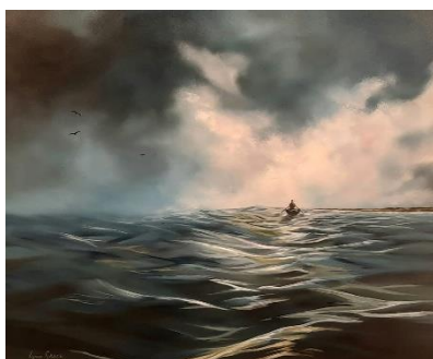
3 rd place, Lynn Grace