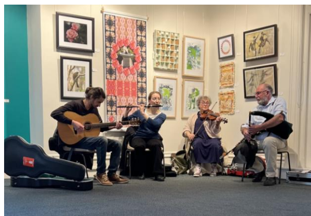
Celtic group, Erin Street playing at OAS galleries during New Zealand music month.