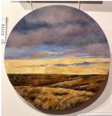
Roy Dickison Trophy (Heart of the South):