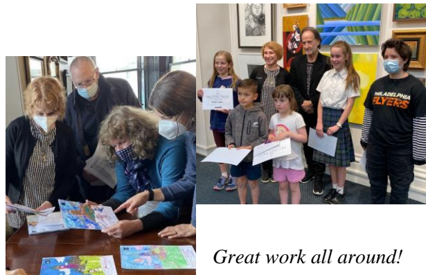
Great work all around!

The winners of the OAS colouring competition, who do you think had more fun, the kids doing the colouring or the council judging? Entrants were asked to colour the Dunedin Railway Station and draw themselves outside. It was great to see the creative interpretation from the young artists who entered.