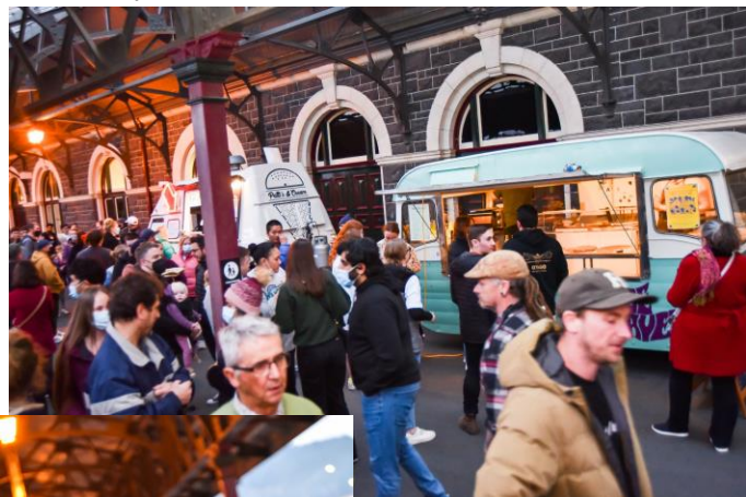
Above: Scenes from the Dine Dunedin event.