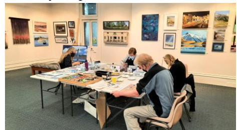
Thursday Painting group hard at work.

Open to all OAS members to come along for a bit of painting, inspiration, and socialization. 11:00-3:00 every Thursday. (Open to all mediums)