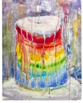
Rainbow Cake by Pauline Bellamy (Acrylic)