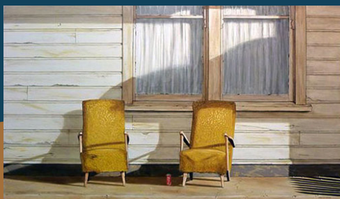
PAUL LINDSAY - TWO CHAIRS - NO WAITING

FOR MORE DETAILS AND THE ENTRY FORM VISIT www.hopeandsons.co.nz