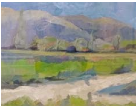
3rd: Baden French, Awatere in Flood, oil.