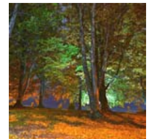
Right: Town Belt in Autumn , Raimo Kuparinen.