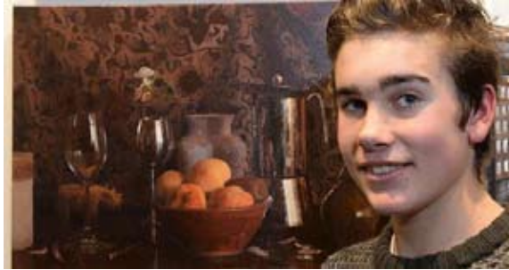
Otago Daily Times

"This work is a playful and humorous comment on the very serious topic of consumerism and popular culture. Its clever concept and abstractness capture the absurdity of our modern world. It is aesthetically beautiful at the same time."