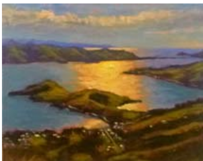
2nd: Phillip Beadle, Above Portobello, Otago Harbour , oil.