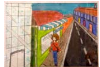
4th: Lola Tannock, Dunedin North Intermediate