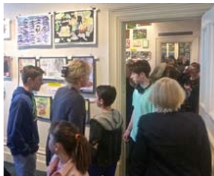
Party fare for young artists and their families, then the thrill of seeing their work exhibited.

SPRING EXHIBITION Sponsored by Ryman Healthcare