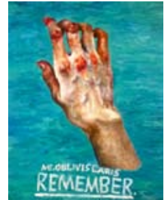
2nd: Charlotte Campbell, Bayfield