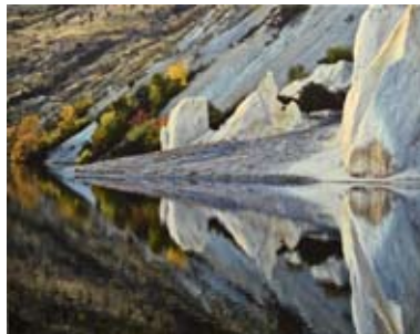
Reflecting at St. Bathans , photography by Jenny Longstaff.