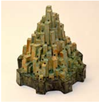
Babel , ceramic by Hamish Cormack.