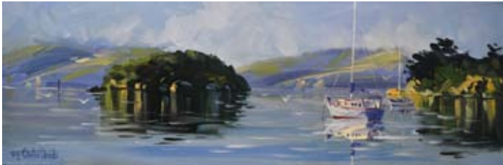
View from Edwards Bay , acrylic by Tony Shields.