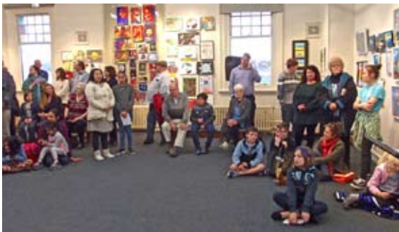
Part of the opening night audience for the announcement of this year's Youth Art Awards. The students' work always gets a great response from the viewing public.