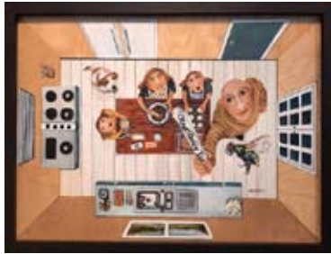
Anne Baldock, Not a Fly Cemetery , Acrylic on Plywood Pieces