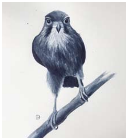
Indigo New Zealand Falcon

Thurs. 25th March – Mon. 5th April Macandrew Bay Hall Open daily, 10am to 4pm