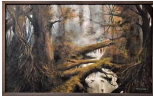
Andrew Cook, Forest Falls , Oil

Another painted collage made with considerable planning and skill in its construction. The clever play with telescoped spatial structure is beguiling. The craziness of gesture and expression presents well. The clarity of drawing and colour disposition enhances expressive effects.