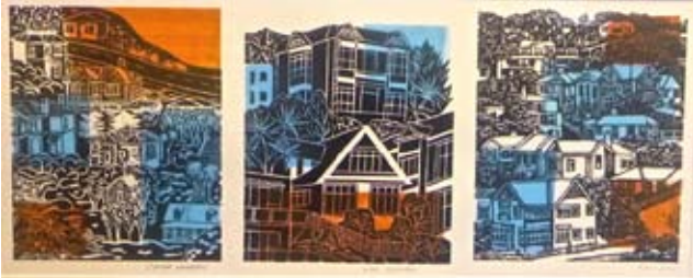
Close to Home, by OAS printmaking group, "Think Ink"