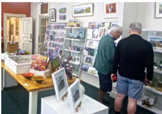
Visitors often comment favourably on the high standard of work and presentation in our shop.

Presented as part of the Dunedin Fringe Festival