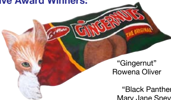
"Gingernut" Rowena Oliver