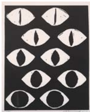
"Five Eyes" Kate Drummond