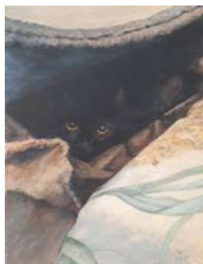
"Do Not Disturb!" Elly Heenan