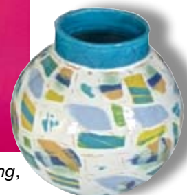
Agate Vase , pottery, Nicole Kolig.

Two items from the recent 145th Annual Exhibition. Variety of artistic expression is a notable feature of our exhibitions.