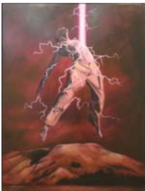
Christopher Vialle Untitled (Oil)