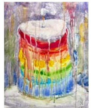
Rainbow Cake by Pauline Bellamy (Acrylic)