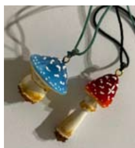
Mushrooms by Jerry Cross (Jewellery)