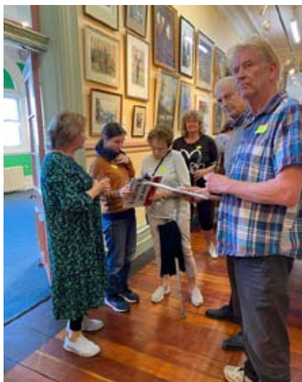
Involved in the absorbing business of finding answers to the Scavenger Hunt quiz.